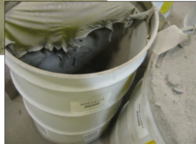
April 2018 Idaho event

Source: RPT-1659, Formal Cause Analysis for the ARP V (WMF-1617) Drum Event at the RWMC