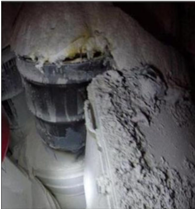
February 2014 WIPP event

Source: DOE Phase 2 Accident Investigation Report, Radiological Release Event at WIPP