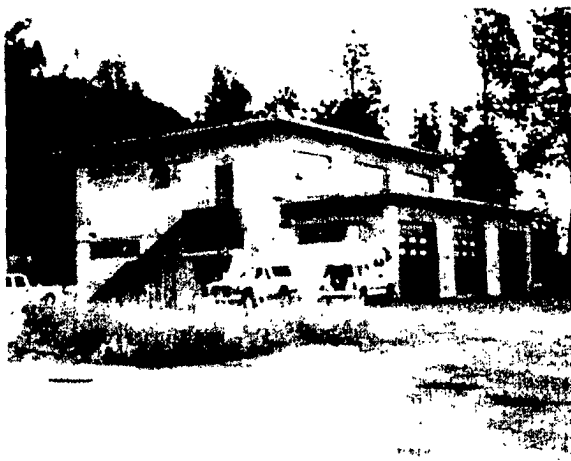
Fire Station 5 (TA-16-180)

Main Benefit: Effective and compliant emergency response to the majority of LANL nuclear and moderate-hazard facilities. Reduced enduring facility maintenance costs and elimination of the deferred maintenance backlog. Addresses emergency response improvement recommendations contained within the FY2009 BNA for LANL.