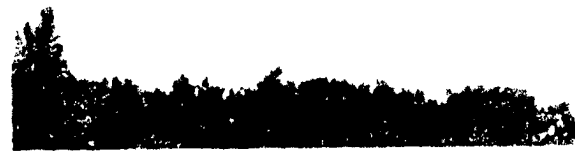
Fire Station 1 (TA-3-41)