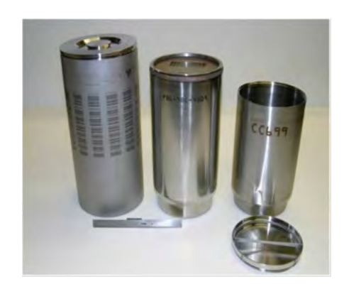
Figure A-1. EPD container configuration, example from SRS. From left to right, these are the outer, inner, and convenience containers.

The second container set included an outer container manufactured by Dynamic Flowform, Inc. (Flowform). The manufacturing process plastically deforms a metal blank around a mandrel to achieve the final container dimensions. The process forms the container base and walls from the same metal blank. The inner container in this container set is the type used in LANL's advanced recovery and integrated extraction system. The convenience container is a crimped lid canister. Figure A-2 shows this configuration.