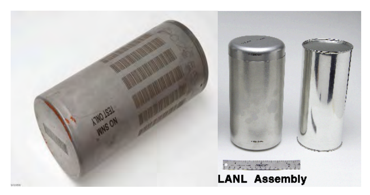
Figure A-2. Flowform container configuration, example from LANL. From left to right, these are the outer, inner, and convenience containers.

The second container set included an outer container manufactured by Dynamic Flowform, Inc. (Flowform). The manufacturing process plastically deforms a metal blank around a mandrel to achieve the final container dimensions. The process forms the container base and walls from the same metal blank. The inner container in this container set is the type used in LANL's advanced recovery and integrated extraction system. The convenience container is a crimped lid canister. Figure A-2 shows this configuration.