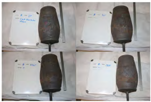
Figure 4-19. Post-test conditions of test vessel for Sequence 8. Angle positions refer to the visible portion of the vessel (see Figure 2-4). Angular positions, in clockwise direction, starting from upper left quadrant: 0°, 90°, 180°, and 270°.

pressures at lower temperatures but suggested that the impact on ARF would be counteracted by less container bulging at the lower temperatures, given that SRNS used a correlation that relates ARF to both failure pressure and container volume (see Figure A-5 for photographs of bulging). This hypothesis would also have to be confirmed by additional testing.