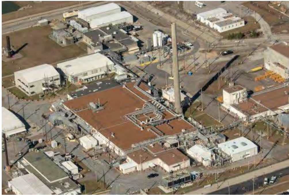
Figure 1. Aerial View of 296-H Stack, next to Building 234-H, at SRTE

DSA. NNSA approved the combined Tritium Facilities DSA in December 2019 but has not yet implemented it. NNSA plans to partially implement this DSA by the end of calendar year 2023.