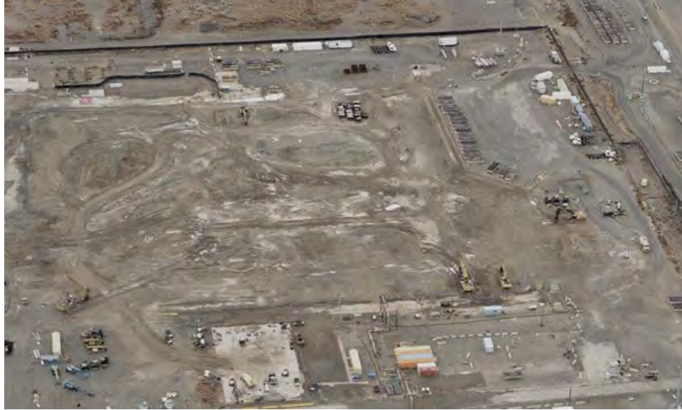
Figure 9. Plutonium Finishing Plant in 2021