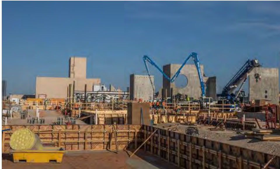
Figure 13. Safety Significant Confinement Ventilation System Construction

The Board's staff has continuously monitored the project, including several site visits to observe the progress of construction and gather updated information. The project has reached several major milestones related to factory acceptance testing for safety-related equipment. The Board's staff is currently conducting a safety review of factory acceptance testing, which is scheduled to conclude at the beginning of 2022.