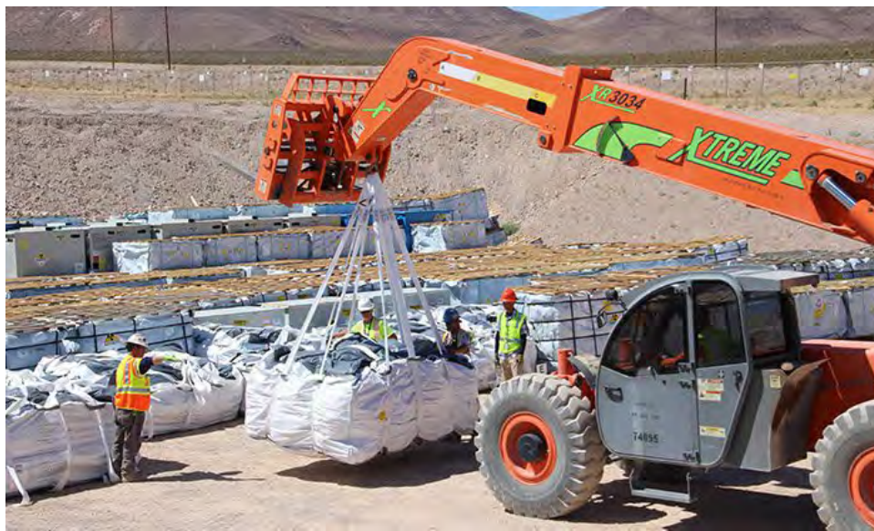
Figure 11. Low-Level Waste Disposal Activities at the Radioactive Waste Management Complex

On November 10, 2021, NNSA 9 responded to the Board's letter and provided the requested report. In the report, NNSA described corrective actions that the site contractor is implementing to improve the quality of safety basis documents, plans to update each facility's safety basis to modern directives, and plans to address the technical issues in the facility safety basis. NNSA plans to provide the companion briefing to the Board in early 2022.