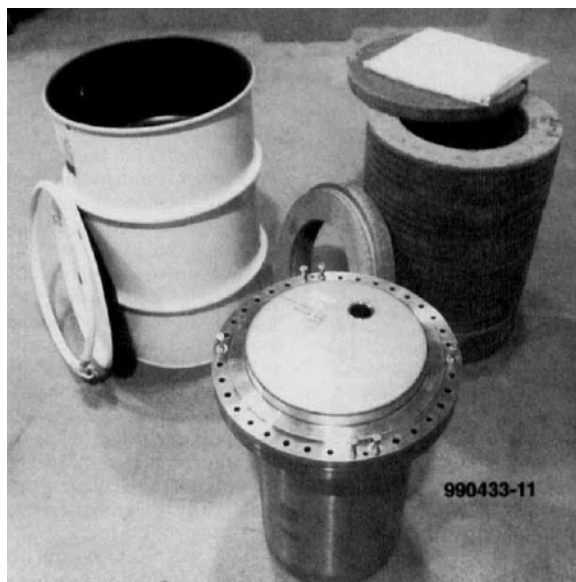
Figure 1. Pit Storage Container with Packing Material and Sealed Insert

From 2020 through 2021, the Board conducted a review of nuclear weapon pit staging at the Pantex Plant. More than two decades ago, the Board had issued Recommendation 1999-1, Safe Storage of Fissionable Material Called “Pits,” which centered on the need to store pits in containers that would protect against degradation of the pits’ corrosion-resistant cladding. In response to Recommendation 1999-1, DOE committed to repackaging pits into containers featuring a sealed insert filled with inert gas to protect the pit cladding. In closing Recommendation 1999-1 in 2005, DOE indicated it had completed repackaging almost all pits at Pantex into sealed insert containers. However, the Board’s recent assessment found that the population of pits in storage containers without inner sealed inserts increased from 8 percent to 14 percent of the total inventory between 2014 and 2021, even as the total inventory of pits increased. Of note, the Board identified that pits from disassembly and dismantlement campaigns have accumulated in these unsealed containers.