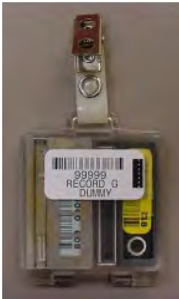
Figure 15. Thermoluminescent Dosimeter to Monitor External Radiation Dose

with the objective of identifying opportunities for improvement to help prevent similar problems at Pantex and throughout the DOE defense nuclear complex. During the review, the Board's staff identified that NNSA and its contractor did not recognize and respond to weaknesses in the external dosimetry program, including significant personnel turnover, aging equipment, lack of timely contract maintenance support, and the unavailability of replacement equipment. The Board's staff also identified lessons learned related to oversight by the NNSA Production Office. The Board's staff will complete its evaluation in 2022.