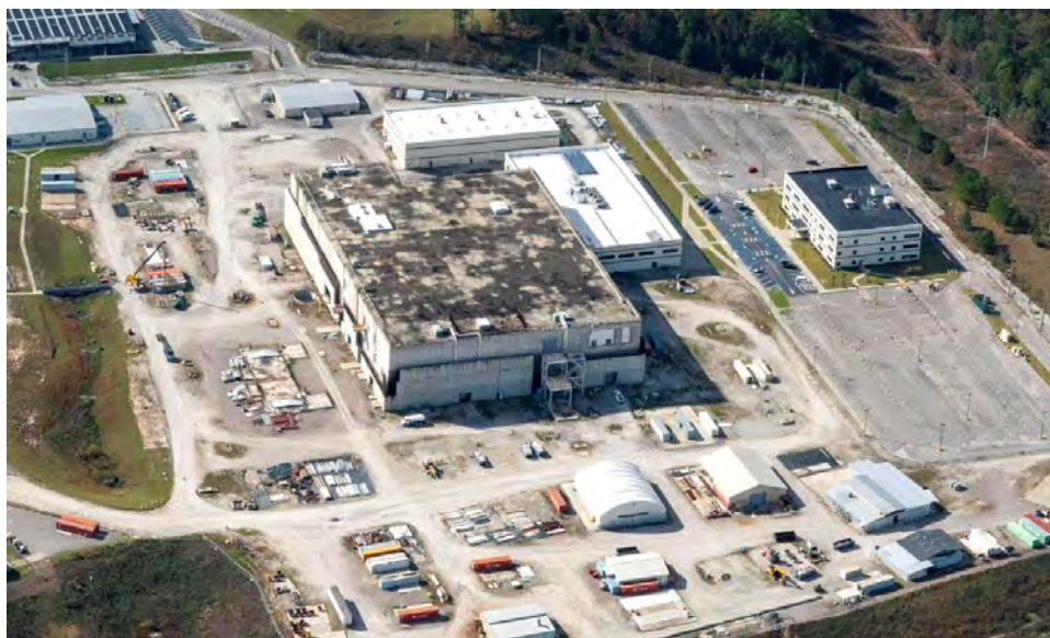
Figure 12. Savannah River Site Building 226-F

The 2018 Nuclear Posture Review recommended establishing “the enduring capability and capacity to produce plutonium pits at a rate of no fewer than 80 pits per year by 2030.” NNSA plans to use the partially constructed Building 226-F located in F-Area of the Savannah River Site for a new plutonium pit production facility. Building 226-F was originally designed for the Mixed Oxide Fuel Fabrication Facility project, which is now canceled. NNSA is repurposing Building 226-F as the Savannah River Plutonium Processing Facility designed to produce 50 of the required plutonium pits per year. On June 25, 2021, the Deputy Secretary of Energy approved Critical Decision-1, Approve Alternative Selection and Cost Range , for the Savannah River Plutonium Processing Facility, marking the completion of the project definition phase and the conceptual design. NNSA stated in its Critical Decision-1 approval letter that it estimates project completion between fiscal years 2032 and 2035.