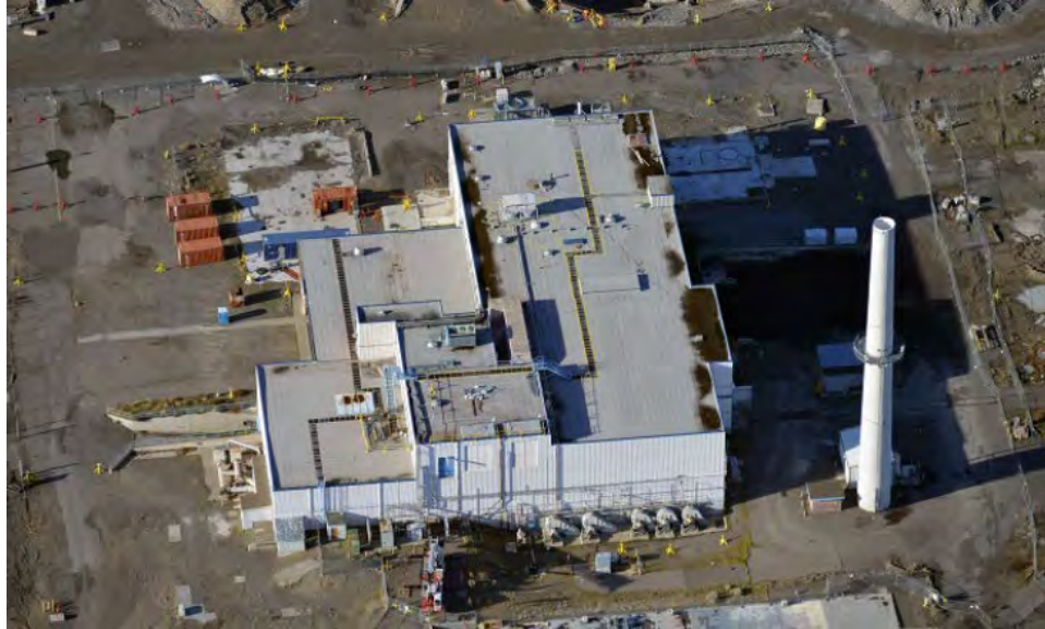
Figure 10. Building 324