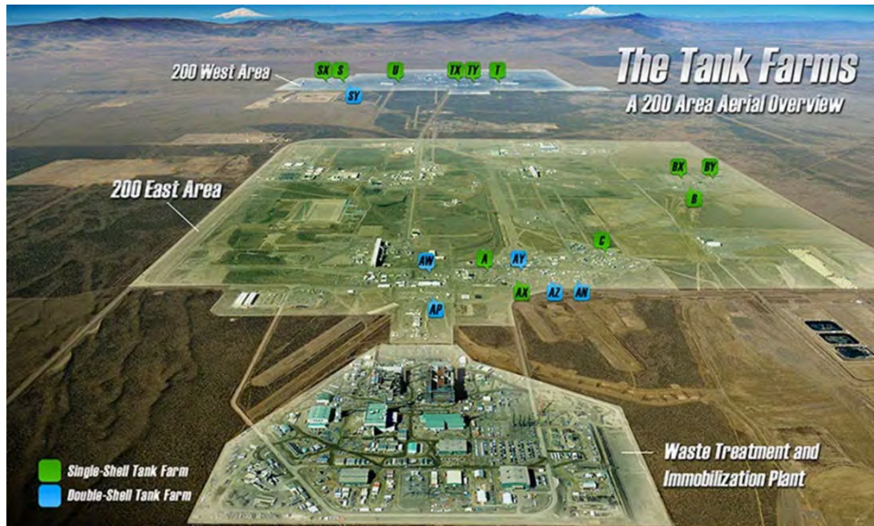
Figure 7. Hanford Tank Farms Aerial Overview

The single shell tanks are beyond their useful life, and despite previous stabilization efforts, which removed most liquids from the tanks, some of the single-shell tanks are leaking liquid waste to the environment. This year, the B-109 tank became the latest single-shell tank to be classified as an assumed leaking tank with an active leak. Between 1968 and 1986, DOE built the double-shell tanks that are used on the site. The aging single-shell tanks were subsequently stabilized by transferring all pumpable liquids to the double-shell tanks. Retrieval of the sludge and saltcake that remained behind in the single-shell tanks involves mobilizing the waste by using pressurized water directed through robotic sluicing equipment, then pumping the slurry to a double-shell tank for safe storage.