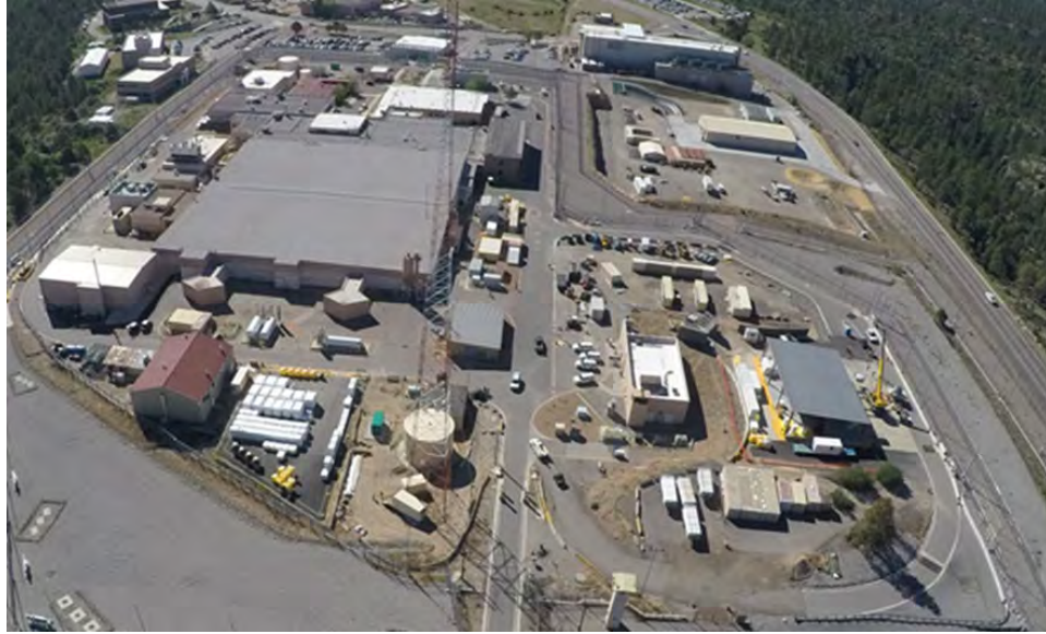
Figure 2. Los Alamos National Laboratory Plutonium Facility (on the left)