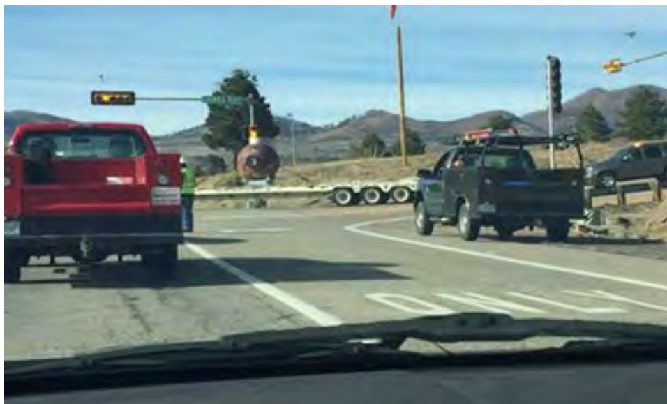
Figure 3. Rolling Roadblock During Onsite Transportation of Confinement Vessel at Los Alamos National Laboratory

On April 8, 2021, the NNSA Production Office and the Y-12 contractor briefed the Board on the requested topics. NNSA Production Office leadership noted its higher expectations for depth and frequency of safety oversight, pushing for continuous improvements in the nuclear criticality safety program, and building on lessons learned. NNSA Production Office leadership also stated that the Y-12 nuclear criticality safety program is being implemented in a manner that ensures safe operations and is improving. The Board remains concerned that, notwithstanding its engagement with site leadership, there have been continued operational safety incidents at Y-12, including events in which ineffective communication among the contractor's organizational elements played an important role. The Board is continuing to monitor the sustainability and effectiveness of improvement actions by the NNSA Production Office and the Y-12 contractor.