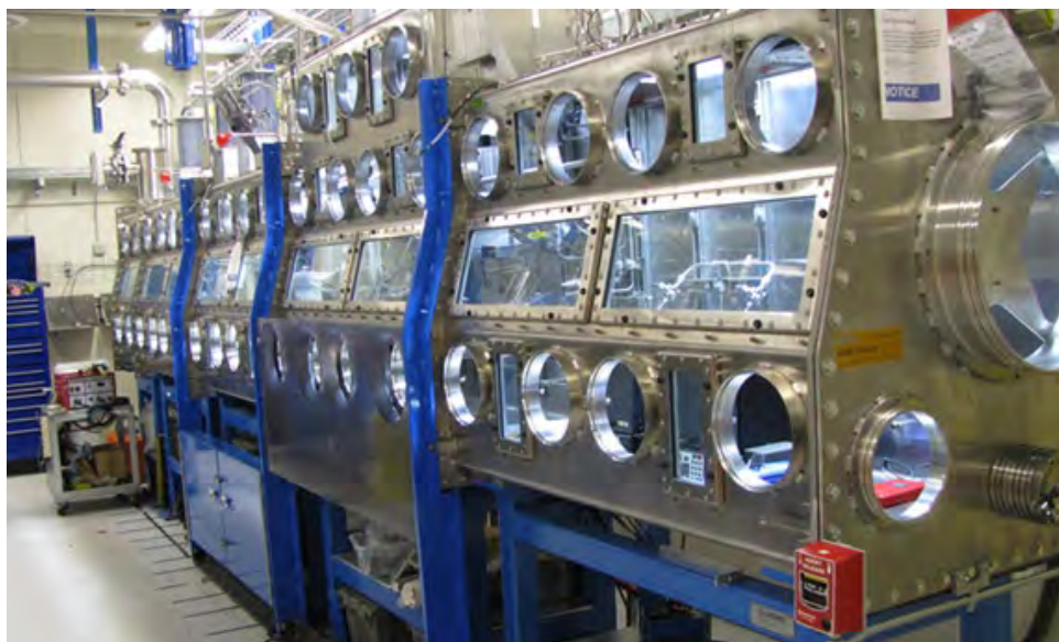
Figure 6. Glovebox Line 1 of the Recovery Glovebox Line

The Board's staff is reviewing revisions to the documented safety analysis and technical safety requirements for Building 332 to incorporate the hazards and controls associated with the Recovery Glovebox Line. In 2022, the Board's staff will complete its evaluation and provide safety oversight as readiness preparations are completed and operations commence.