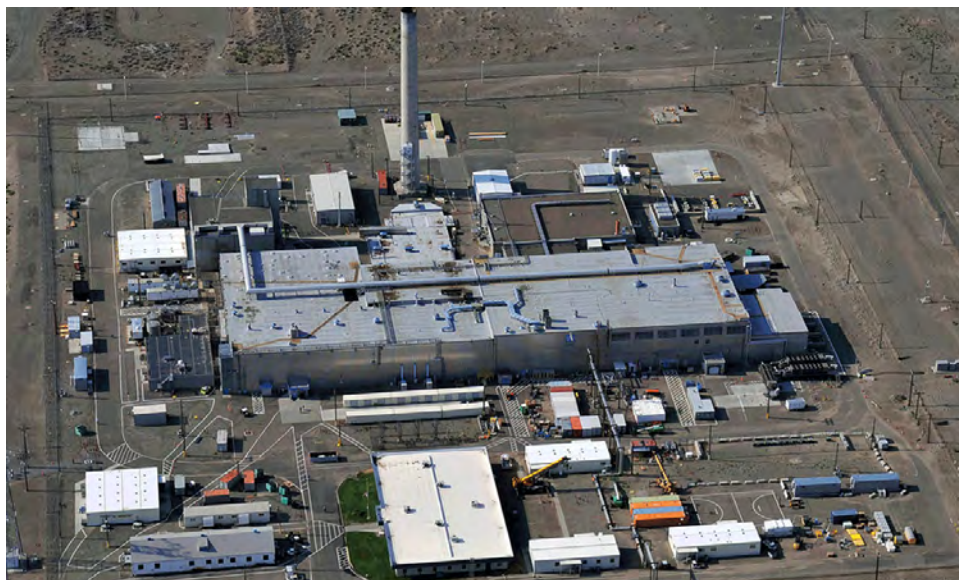
Figure 8. Plutonium Finishing Plant in 2016

Considering the contamination spread events observed in 2017, the Board continued to provide safety oversight of deactivation and decommissioning activities at the Plutonium Finishing Plant throughout 2021. Following the end of operations at the facility in 1989, it represented one of Hanford’s most significant hazards with respect to the potential for radioactive material release. Demolition work at the facility began in 2016 and concluded in November 2021. Key metrics associated with Plutonium Finishing Plant’s demolition are removal of more than 90 structures as well as disposal of more than 14,000 tons of waste, 232 gloveboxes and ventilation hoods, 35,800 linear feet of asbestos insulation, 1.5 miles of ventilation piping, and 8,900 feet of ventilation duct.