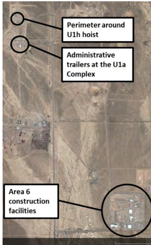
Figure 4. Aerial View of the U1a Complex and Area 6 Construction Facilities

The Board’s letter also advised NNSA and its contractor to reduce the hazards of operations at the U1a Complex by completing the initiative to procure a more robust shipping container for subcritical experiments that would protect radiological material from insults, including seismic-initiated events, during onsite transfers. Lastly, the Board advised DOE to consider revising DOE Standard 3009-2014 to ensure that accident scenarios with high consequences to the co-located worker are appropriately analyzed and controlled.