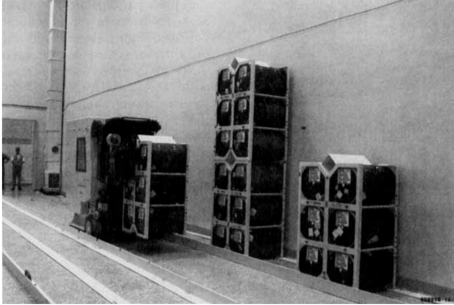
Figure 1. Initial loading of a room at Building 12-116 (late 1990s) with AL-R8 containers without sealed inserts in a “stage-right” configuration.

Pit Containers —The following containers are currently in use for pit staging at Pantex: the AL-R8 without sealed insert, AL-R8 Sealed Insert, and FL containers. Other approved pit containers, as described in Table 2.7.8-1, Nuclear Materials Container Summary , of the Sitewide SAR [9] and on the approved containers list of Section 5.7.9.1 of the TSRs [5], are not currently in use. 2 A brief description of pit containers currently in use at Pantex follows: