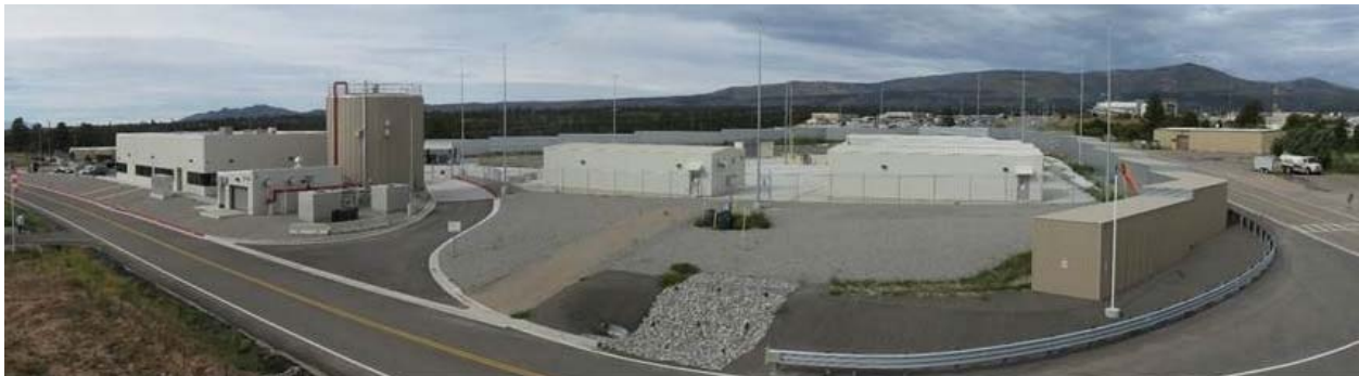
Transuranic Waste Facility, Los Alamos National Laboratory

NNSA recently finished constructing a new Transuranic Waste Facility to replace the transuranic waste storage facilities in Area G. The new facility will be capable of staging and storing up to 1,240 drums of waste created by the enduring missions at Los Alamos National Laboratory. In addition, its characterization function will certify waste containers to meet the acceptance requirements for shipment to and disposal at WIPP.