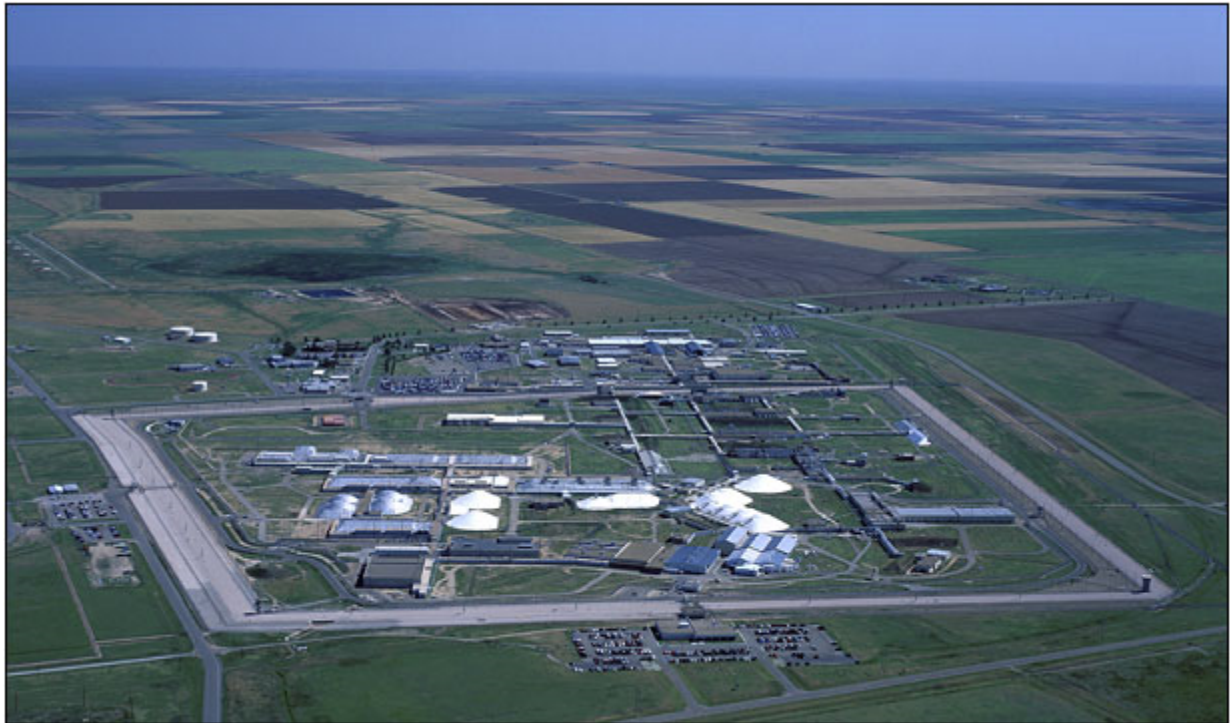
Pantex Plant, Amarillo, TX