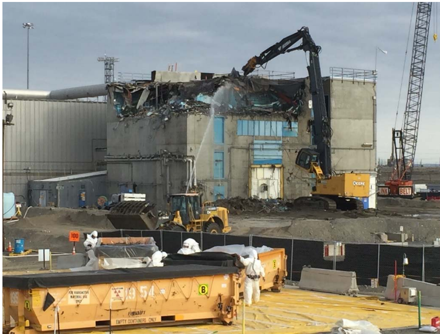
Demolition of the Hanford Plutonium Reclamation Facility