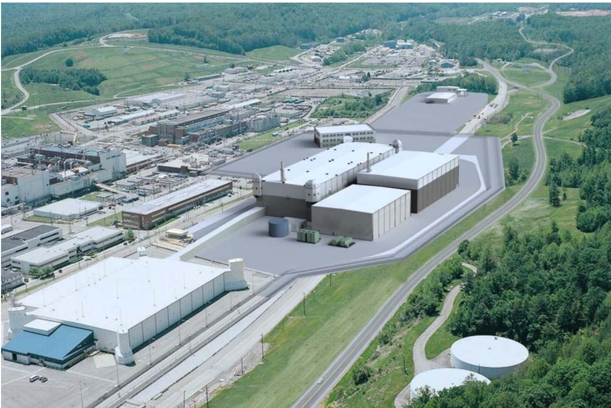
Artist's Rendering of the Uranium Processing Facility, Y-12 National Security Complex

Enriched uranium processing and fabrication are vital to maintaining the Nation's nuclear weapons stockpile and supplying fuel for the United States Navy's nuclear-powered warships. NNSA's current modernization strategy calls for replacing certain capabilities from the aging 9212 Complex at Y-12 by 2025. Under the Uranium Processing Facility (UPF) Project, these capabilities will be installed in multiple facilities segregated by safety risk and security requirements.