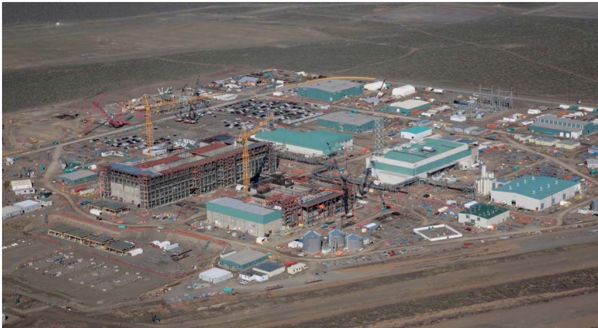
Waste Treatment and Immobilization Plant, Hanford Site

In 2012, DOE restricted engineering, procurement, and construction work on the PT and HLW Facilities because of unresolved technical and safety issues and misalignment between the design and the nuclear safety basis. DOE directed its contractor to address open issues before DOE would authorize resuming engineering, procurement, and construction work for these facilities. On August 19, 2014, DOE authorized the contractor to resume engineering work to finalize the design of the HLW Facility, with limited procurement and construction. However, a considerable amount of work still remains to resolve the open issues.