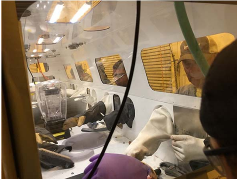
Mockup of Glovebox for Treatment of RNS Waste

At the end of 2016, LANL was preparing for readiness reviews to conduct treatment activities. LANL intends to complete the treatment before the start of the 2017 wildland fire season.